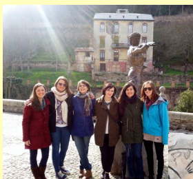
Subsample of Limnos enjoying sunny Granada