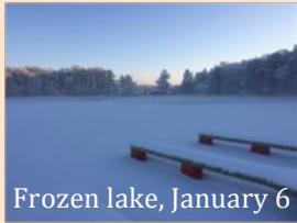
Frozen lake, January 6

At the time of the workshop it was still possible to run into the lake after sauna (which is generally not recommended unless there were Vikings in your family), but now Erken is completely frozen, waiting for the Limnos to come back in spring with some good ideas for the mesocosm experiments.