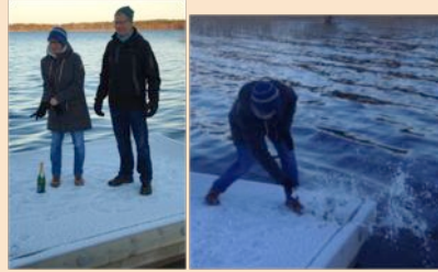
New dock, inaugurated in the best naval tradition

On December 15 Erken hosted a one-day workshop for brainstorming the upcoming mesocosm experiments within the KAWater project, funded by Knut and Alice Wallenberg foundation. Workshop participants had a pleasure to visit and inaugurate a new dock, built specifically to provide an access to future mesocosms.