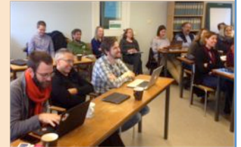
Our collaborators from BMC were also among the participants